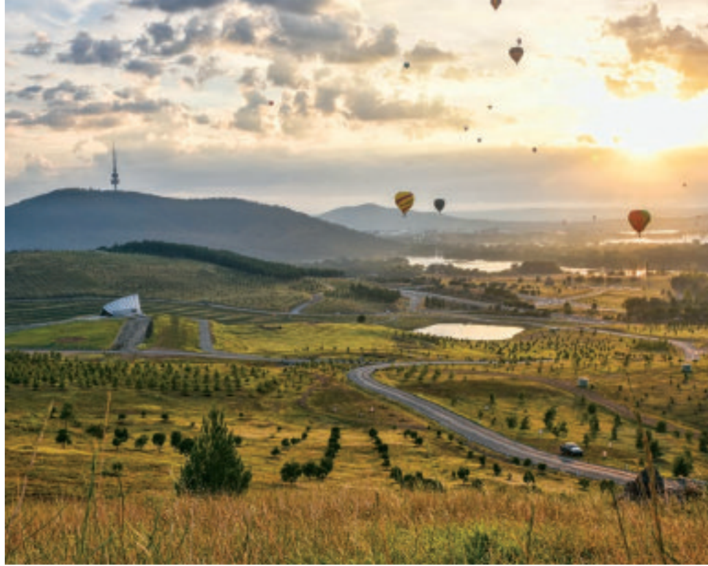
"Canberra Sunrise"